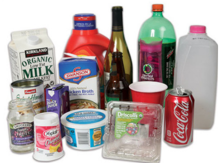
These items are recyclable only if they have been emptied and rinsed

All items should be empty, clean, and dry.