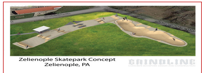
Skatepark Construction Begins Summer 2019

Have you noticed our expanding adaptive playground at the park? Thank you to a grant from The Butler County Park and Recreation Local Park Renovation Program; there will be more playground pieces coming.